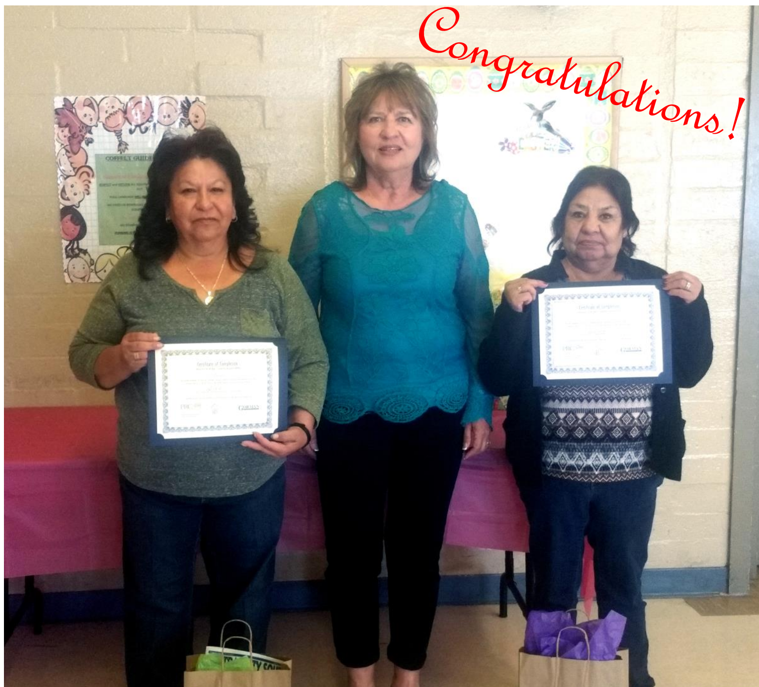
First residents to graduate from the Communities for All Ages Leadership Academy from the Coffelt Community